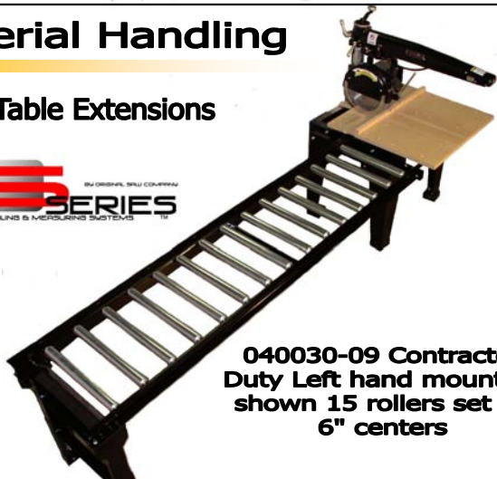
040030-09 Contractor Duty Left hand mounting shown 15 rollers set on 6" centers

All material handling roller tables are 20" wide and 8 foot long with a flange on the rear for mounting manual or automatic stop systems. The below listed catalog numbers vary with the number of rollers and the mounting brackets.