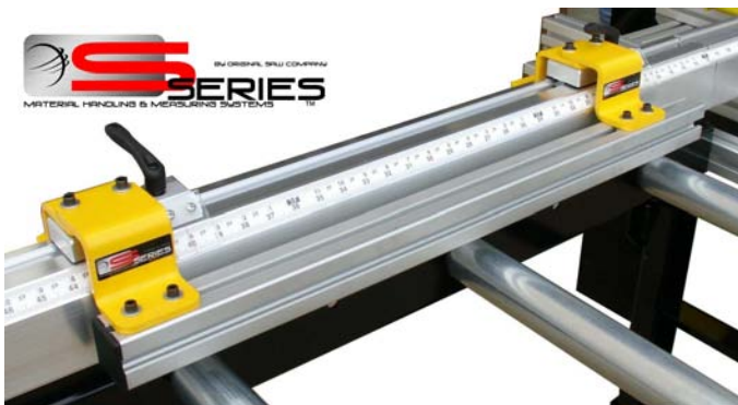
900705 Sliding Stops

Our manual adjustable sliding stop system is designed to stand up to rigorous daily use and heavy material. The system consists of a heavy extruded aluminum rail with measuring tape, a precision machined aluminum slide assembly with locking knob, durable viewing lens with sight line, and an adjustable aluminum extrusion used to fine tune the system and allow it to measure down to 2". These stops attach to our roller tables with included mounting hardware, and are available in 8' and 16' sections and in both right and left hand configurations.